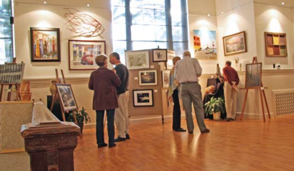
Gala exhibit openings in The Art Center are a much-anticipated part of social life in Blue Ridge.