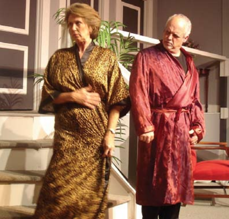
From theater to dance and summer jazz and blues concerts, the arts seem to embrace everyone in Blue Ridge. At last count, the Blue Ridge Mountains Arts Association had offered a total of 91 classes in the arts, including ongoing classes in dance and music.