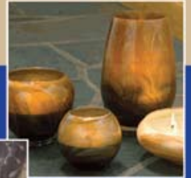
Elegant Esque Candles