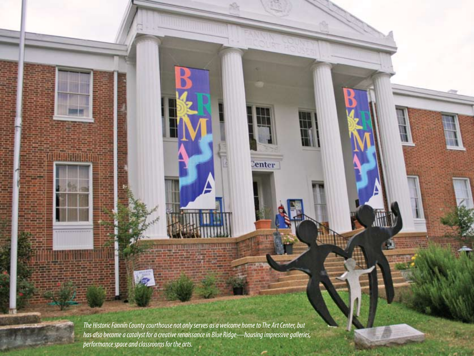
The Historic Fannin County courthouse not only serves as a welcome home to The Art Center, but has also become a catalyst for a creative renaissance in Blue Ridge—housing impressive galleries, performance space and classrooms for the arts.