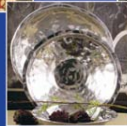
Beatriz Ball Fine Metalware